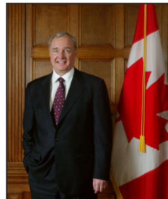
Right Honourable Paul Martin